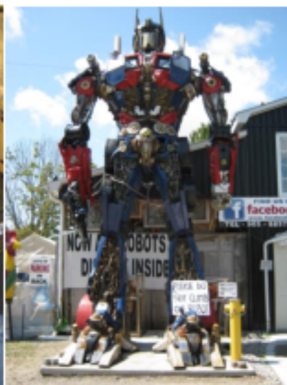
Here are some pics from the Bala Ride.